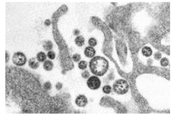
Figure 1: Lassa Virus.

Lassa virus is a member of the Arenaviridae and causes Lassa fever in predominantly West Afrika. The main reservoir is formed by local rodents. Up to half a million people are estimated to attract the disease yearly and mortality rates may reach as much as 50%. Viral proteins, coded within two ambisense RNA strands, include GP1, GP2, NP, polymerase and Z matrix protein. EBS-I-314 reacts with NP, which harbor the RNA strands within the virion. Reactivity of EBS-I-314 is confined to isolates from Sierra Leone, Guinea and Liberia. Nigerian and South African isolates are so far not identified by this antibody. The epitope is different from the epitope recognized by the NP antibodies EBS-I-306 and EBS-I-315.