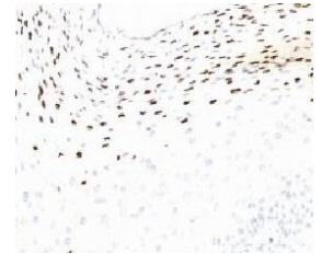
Figure 1: Human cervix stained for HPV-18 E6 (frozen)