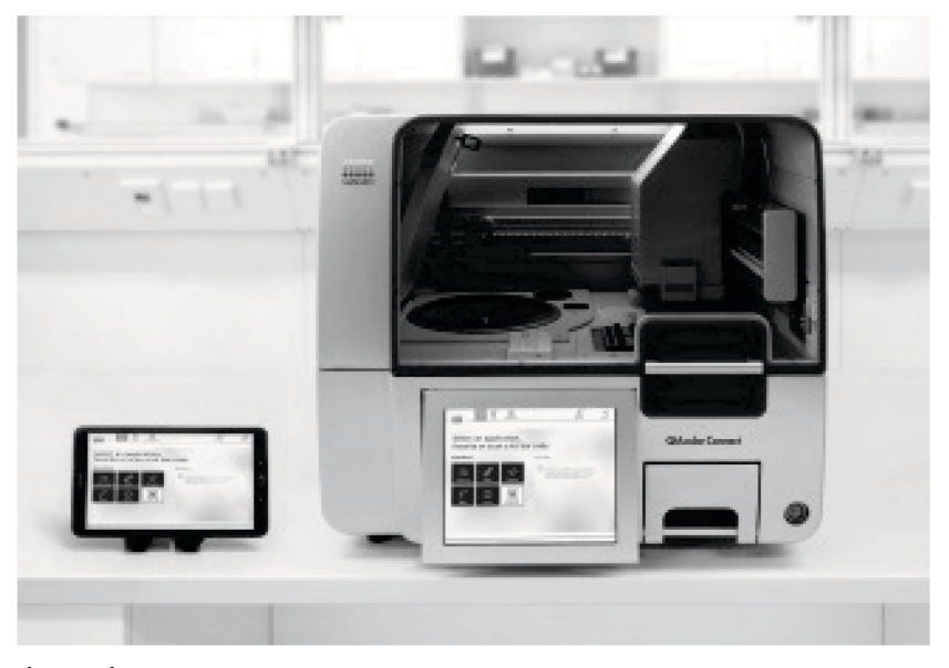
The QIAcube Connect.

QIAcube instruments are preinstalled with protocols for purification of plasmid DNA, genomic DNA, RNA, viral nucleic acids and proteins, plus DNA and RNA cleanup. The range of protocols available is continually expanding, and additional QIAGEN protocols can be downloaded free of charge at www.qiagen.com/qiacubeprotocols.